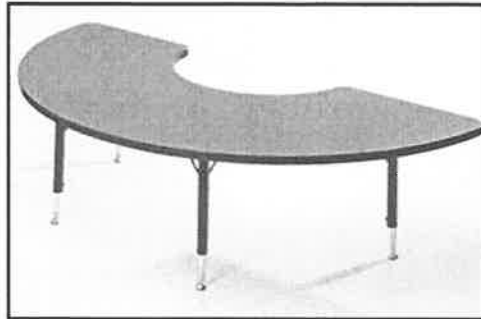
TABLE WITH A SEMICIRCULAR TOP

The information on how the semicircular tops are cut from the square piece of wood is in ANNEXURE B. The dimensions of the wood are 2,7 m × 2,7 m with a thickness of 38 mm.